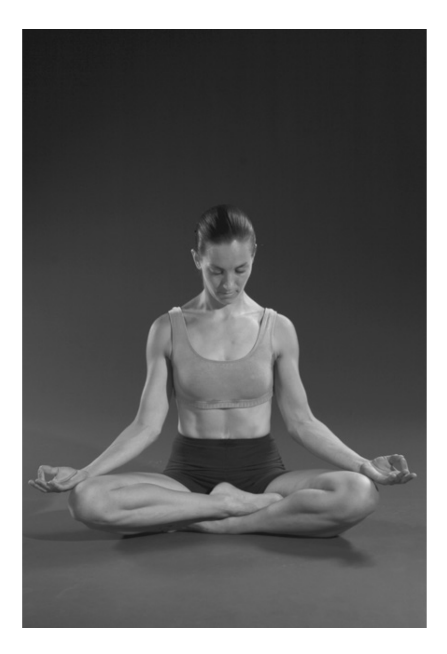
जालन्धरबन्ध & मूलबन्ध – Jalandharabandha & Mulabandha